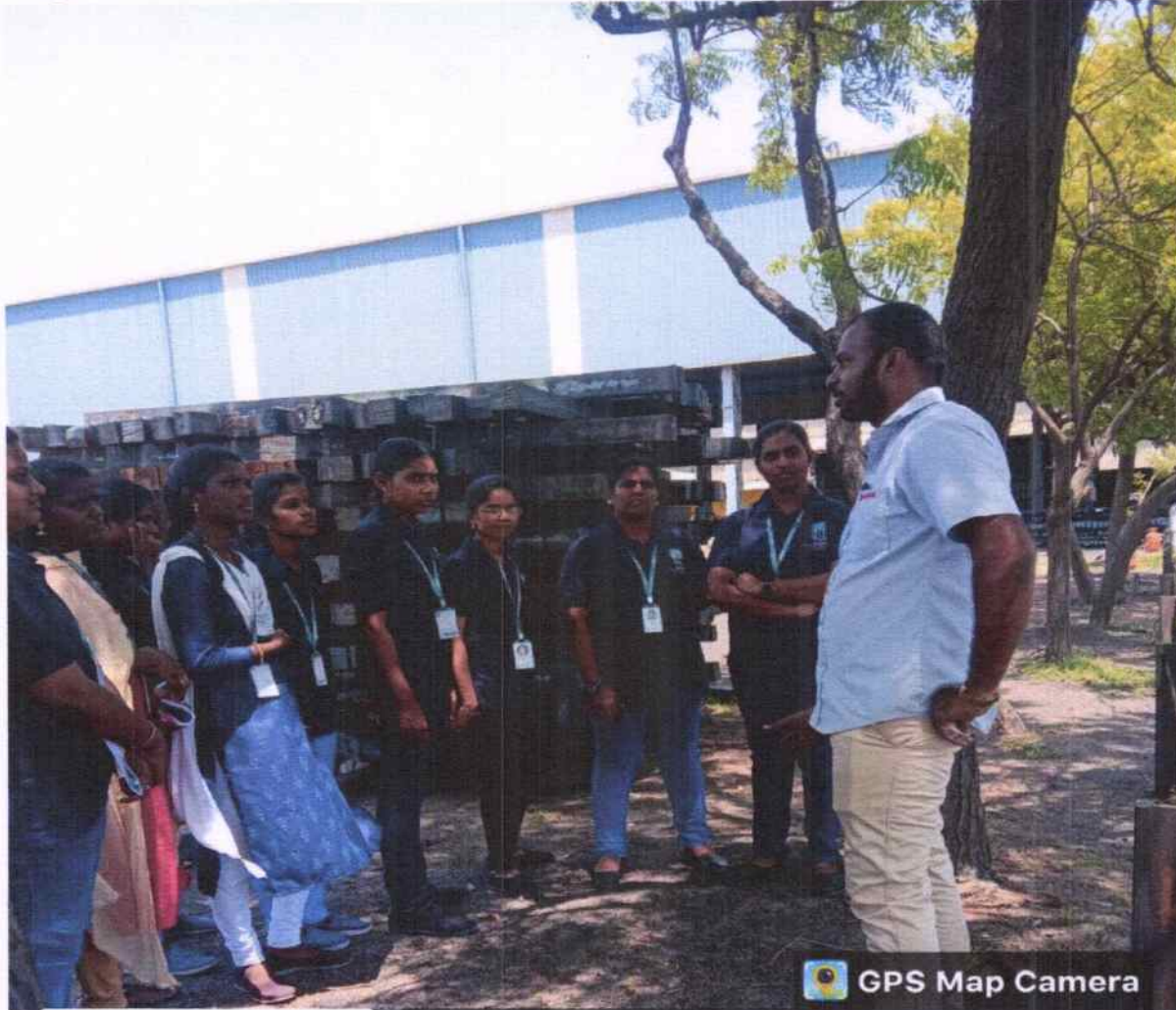
Industrial Visit at AMMAN-TRY Steels (P) Limited, Trichy