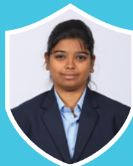
INFANTENA MARY D 15 th RANK