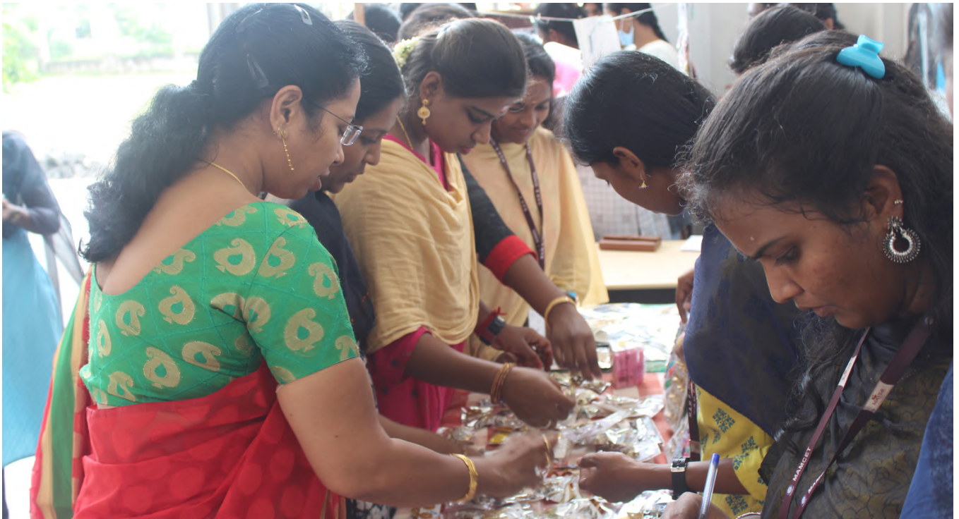
One day programme on "Saturday Mercato" on 13th November, 2021.