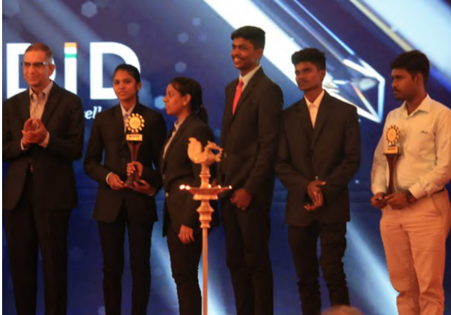
M.A.M. B-School, a standalone Business School in Trichy participated and presented Yi TRICHY- YUTRY 2.0 on 11.11.2021.