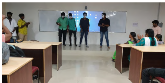
Two days "TALENT SPOTTER" program for students on 07.10.21 & 08.10.21