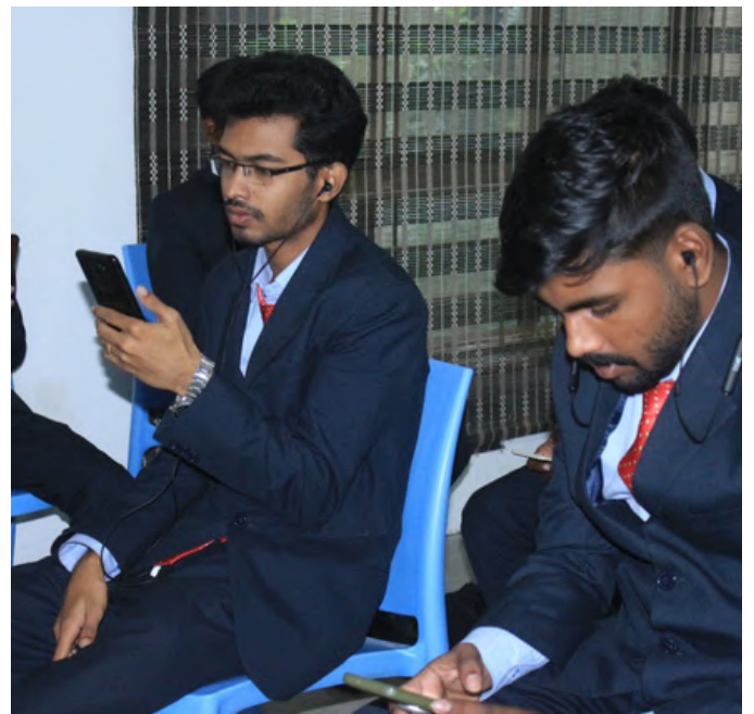
M.A.M. B-School, a standalone Business School in Trichy organized "OPPO PLACEMENT DRIVE" For Management Graduates" on 15th November, 2021.