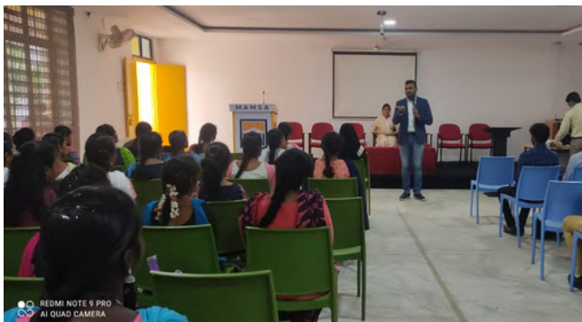
Muthoot Finance Placement Drive