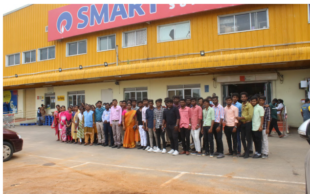
M.A.M. B-School, a standalone Business School in Trichy organized one day Industrial Visit at "Reliance Mart", Kattur on 17th November, 2021 arranged for II MBA students.