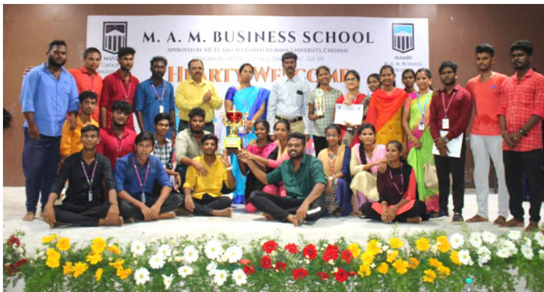
“B-Fest 2022: Inter College Management-Cultural Meet for U.G. Students” on 12th May, 2022