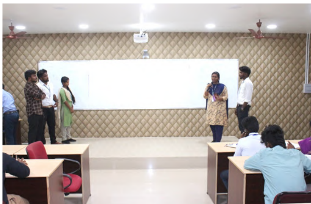
“Environmental Protection” on 18th April, 2022.

EXNORA (YEI) organized paper presentation competition “Environmental Protection” on 18th April, 2022. The students presented their papers on “Environmental Protection”. Under the theme, the students were presented on the areas that comprise Global Warming, Issues & Challenges in industries, various forms of pollution and steps to mitigate, Environmental Sustainability were some of the themes as part of the paper presentation. As part of the competition, the students covered on overview of Environment and its nature, plant sapling, eco-friendly practices and initiatives, various government schemes for protection of environment etc