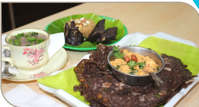
Millet Food Display

IITM BUILD CLUB and Cultural Club organized a “Millet Food Contest” on 22nd April, 2022.