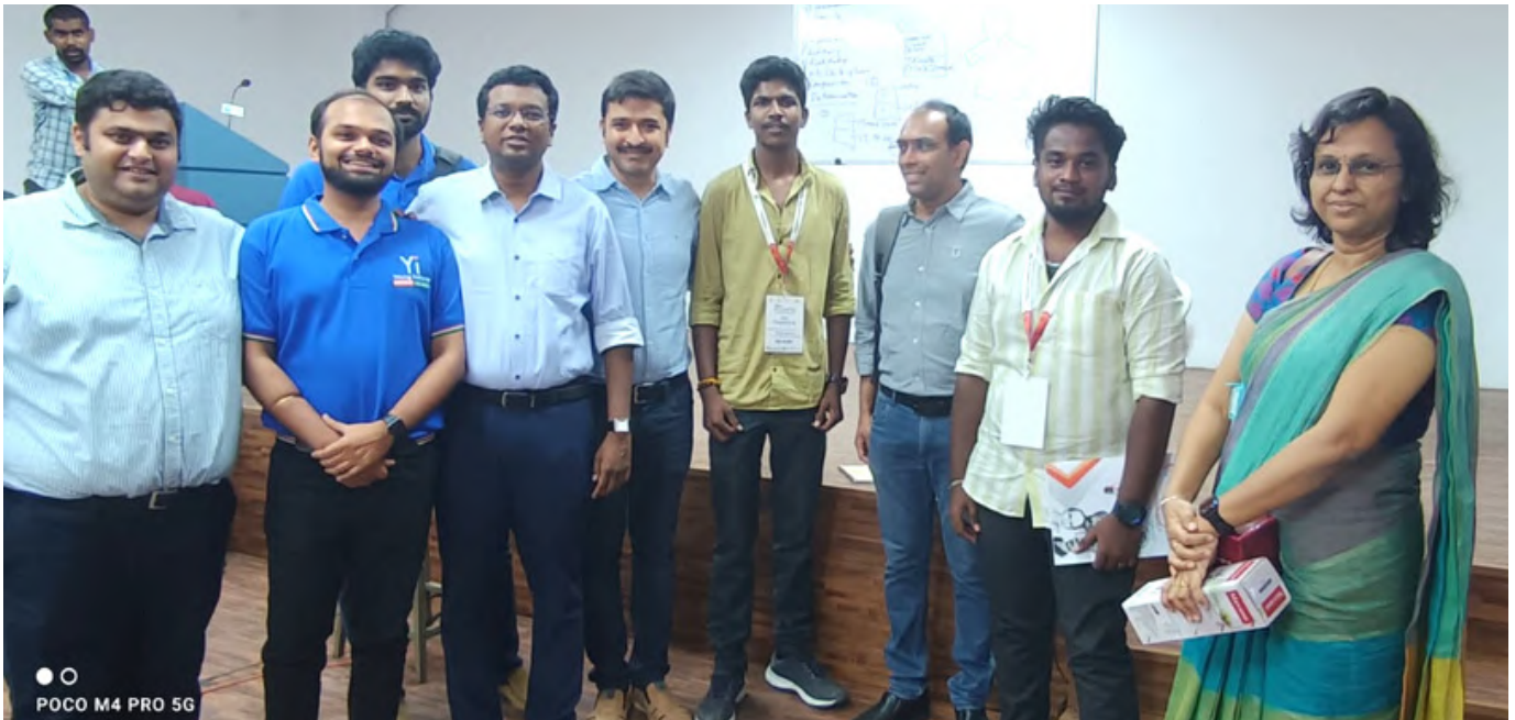
Yi Chennai Chapter and Rajalakshmi Institute of Technology, Chembarambakkam organized Yuva Force Resident Transformational Youth Leadership Program on on 5th August 2022 & 7th August 2022.

Yuva Force Resident Transformational Youth Leadership Program held between August 5th 2022 and August 7th 2022, conducted jointly by Yi Chennai Chapter and Rajalakshmi Institute of Technology, Chembarambakkam.