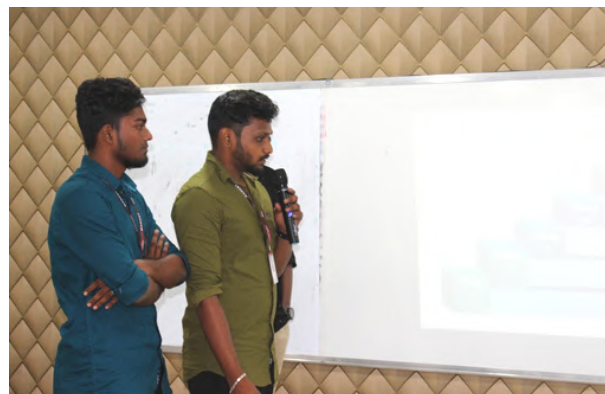
“Growth and Development” on 18th April, 2022.

Junior Jaycee wing (Zone XXIII) organized paper presentation competition “Growth and Development” on 18th April, 2022. The students presented their papers on “Growth and Development” aspects. Based on these, the students were presented on the areas that comprises “Attitudes and behaviours that lead to success” and “Strategies and techniques for building professional brand”. Fielding question after question by the judges, the participants displayed their undying thirst for knowledge, whilst showcasing their immense interest and the astonishing amount of effort put into each of their individual presentations. Along with offering a brilliant opportunity to present on various topics in front of a panel of esteemed judges, the event also sparked up a new array of ideas, concepts in developing the students potential, knowledge and presentation skills .